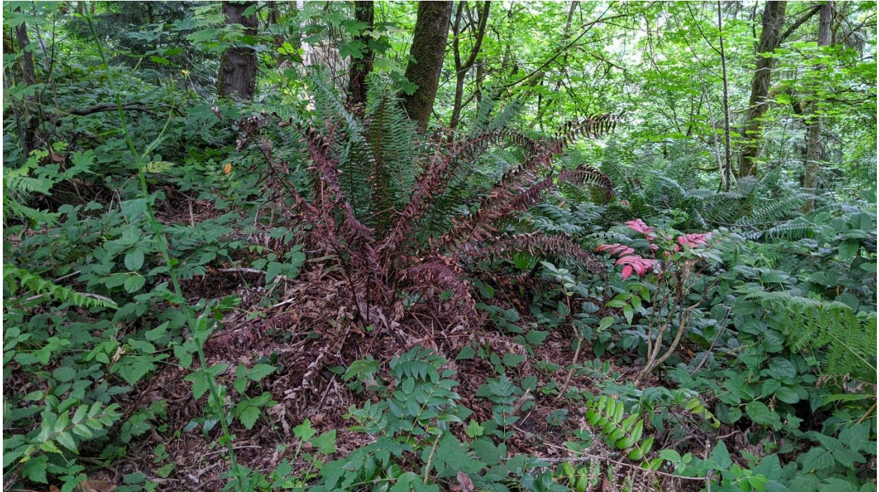
Figure 10: Example of an individual sword fern that died in Upper Luther Burbank Park on Mercer Island. Some of the nearby sword ferns did not have symptoms, despite their close proximity.