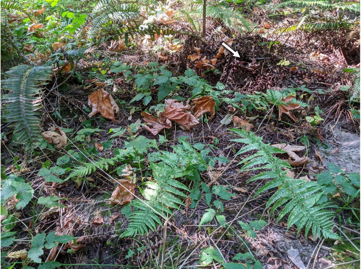
Figure 6: Polystichum andersonii. This fern appeared relatively healthy despite being in close proximity to several dead and symptomatic sword ferns (Polystichum munitum). Arrow indicates a dead sword fern.