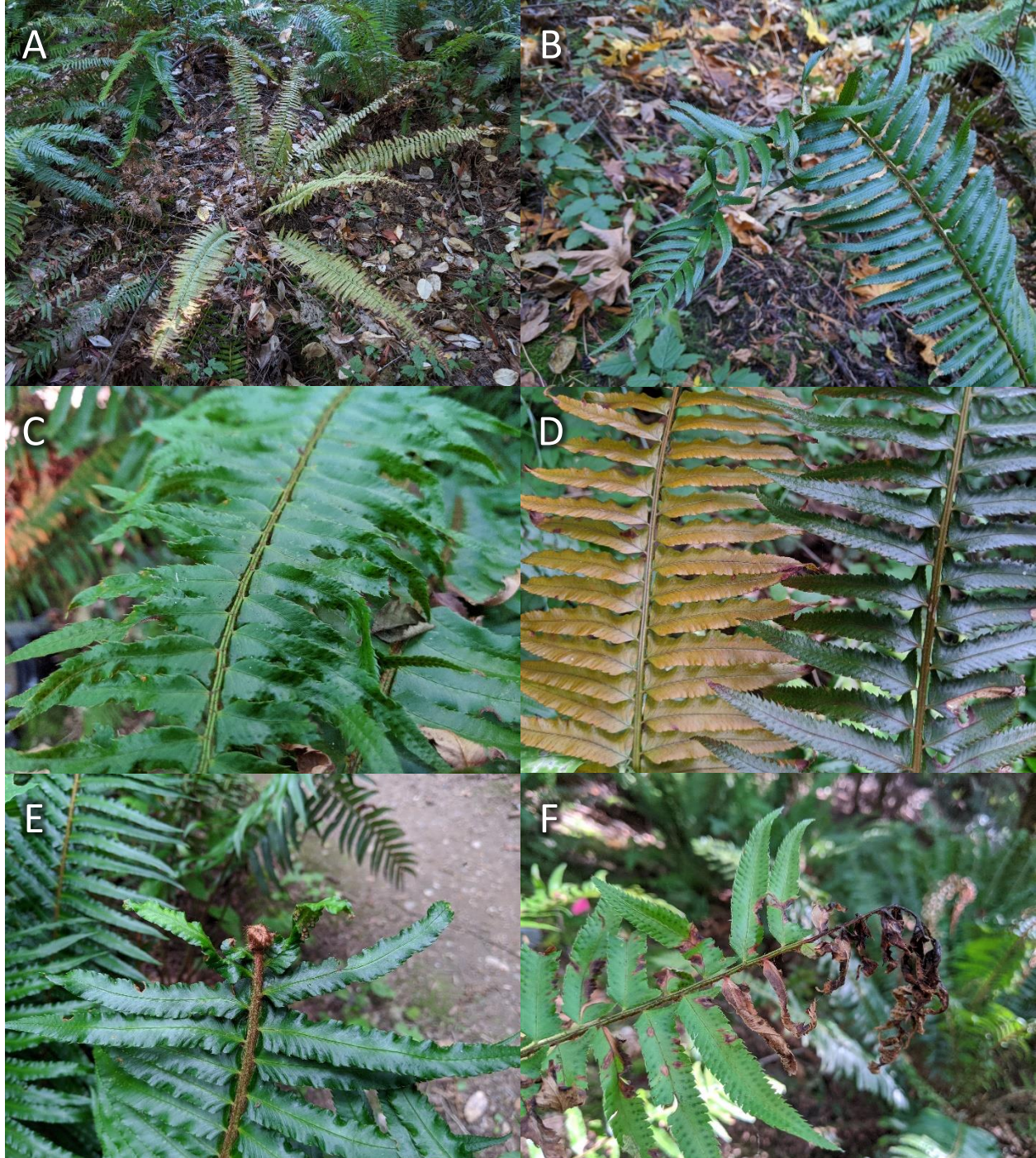
Figure 9: Signs and symptoms of the sword fern die-off phenomenon: A) reduced production of new fronds; B) contorted rachis; C) crispate and contorted pinnae; D) discolored pinnae; E) underdeveloped and aborted fronds; F) die-back at distal end of a frond. In areas affected by the phenomenon, these signs and symptoms can occur in any combination and vary in severity.