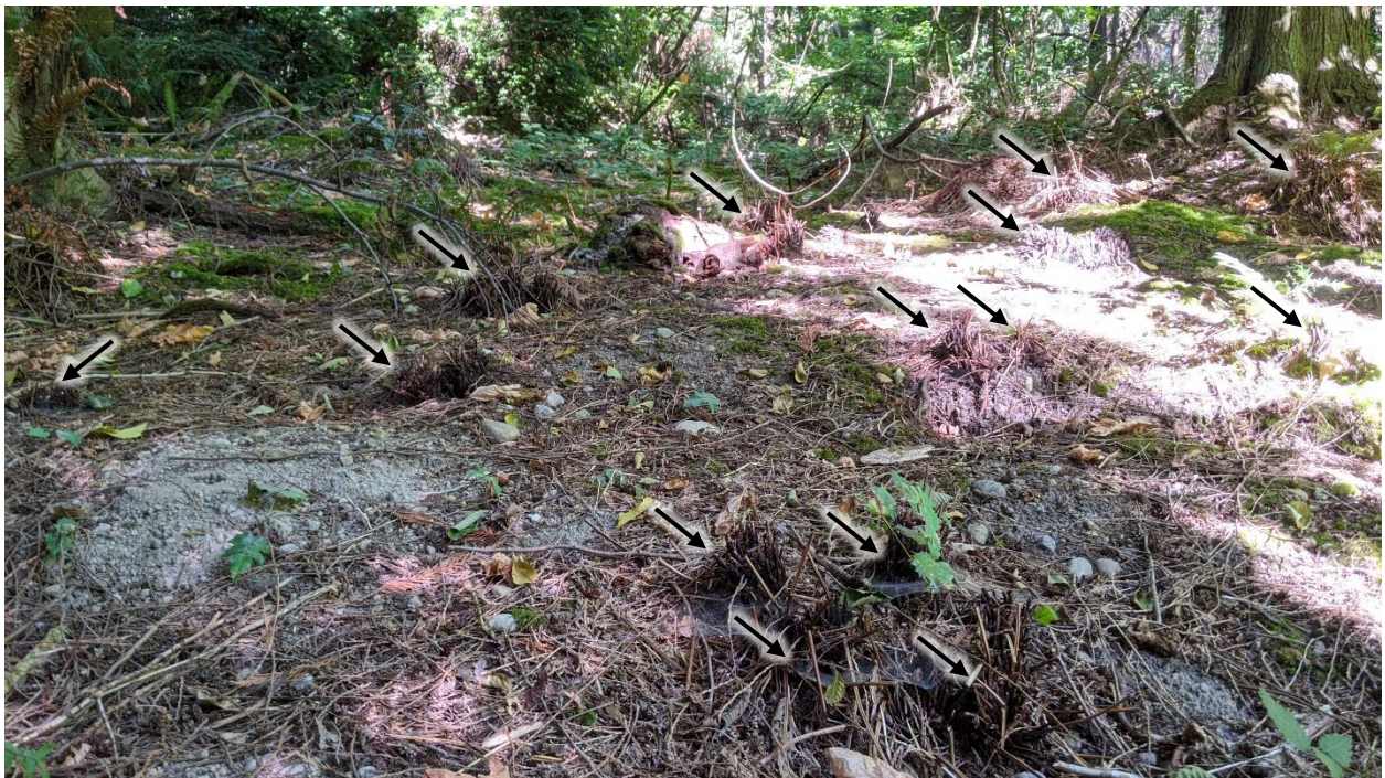
Figure 11: Example of an area in Seward Park previously dominated by sword ferns. Areas with 100% mortality could not be included in our survey. Arrows indicate the remnants of dead sword ferns.