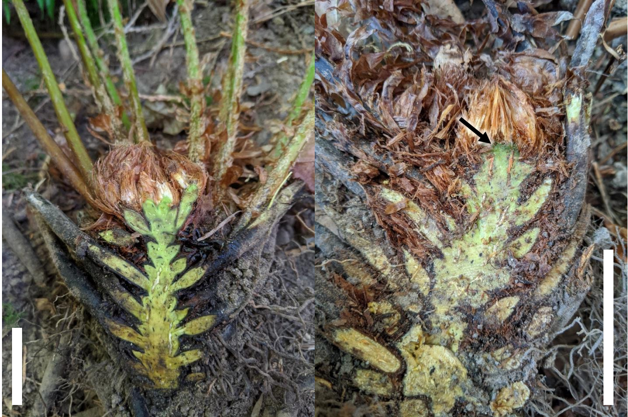
Figure 4: Longitudinal sections through the rhizomes of a healthy fern (left) and a symptomatic fern (right). Arrow indicates leaf buds that failed to develop on the symptomatic fern. Bars represent 5 cm.