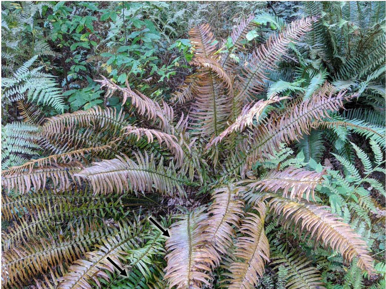
Figure 3: Example of a symptomatic fern (#33) showing evidence of it declining over multiple years. Arrows indicate two distinct cohorts of fronds that presumably emerged in 2018 and 2019. No fronds were produced in 2020.

Some of the symptomatic ferns showed clear evidence of a gradual decline over multiple years. For example, we inferred that fern #33 produced an apparently healthy set of fronds in 2018, a set of discolored fronds in 2019 and no new fronds in 2020 (Figure 3).