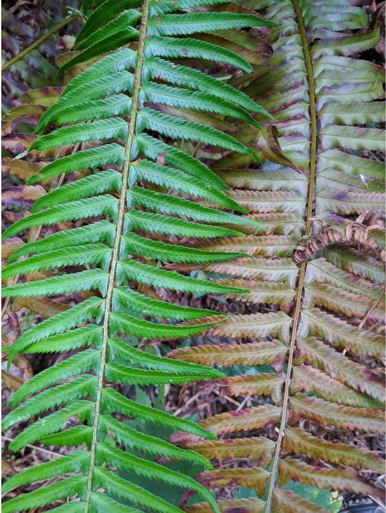
Figure 12: Frond from an apparently healthy fern (left) compared with a frond from a symptomatic fern (right) in Upper Luther Burbank Park on Mercer Island.