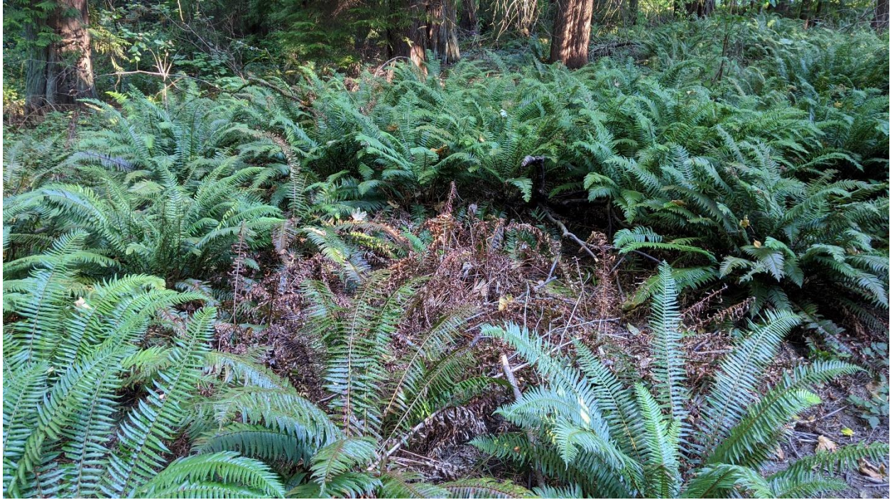
Figure 1: Example of a small patch of sword ferns that recently died in Seward Park. This mortality event occurred in 2020 in an area that was previously unaffected by the phenomenon.