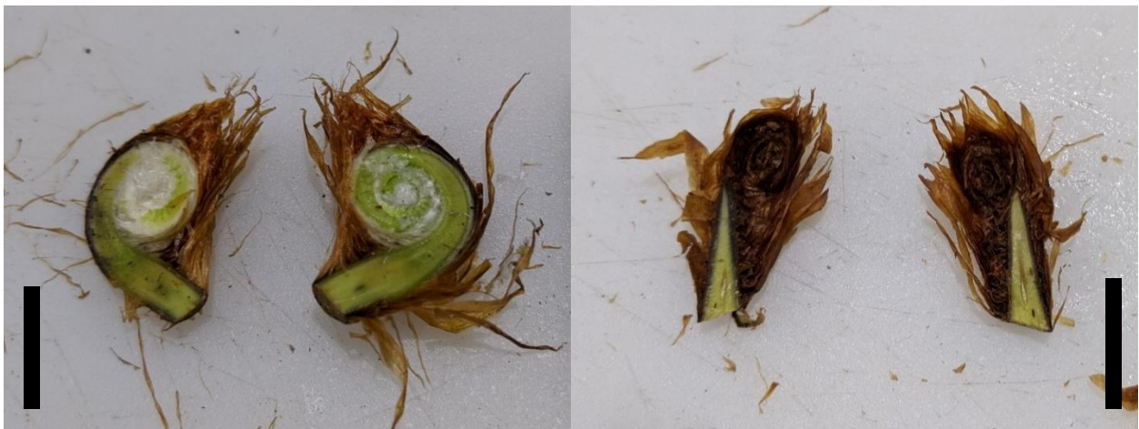
Figure 5: Longitudinal sections through the dormant leaf buds of a healthy fern (left) and a symptomatic fern (right). Bars represent 2 cm.