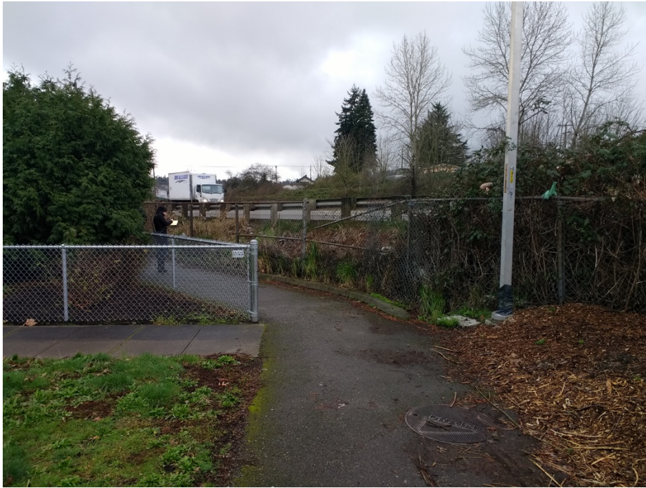
The entrance from the North approaches the main body of the trail with an immediate curve and dense plantings.