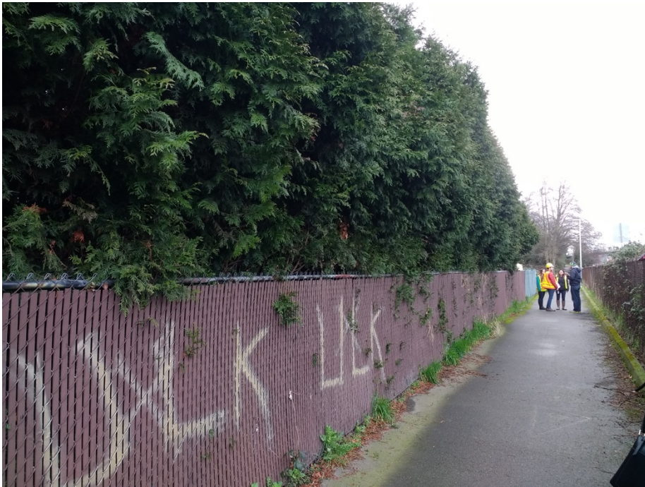
Looking South along the northern third of the trail.

Responsible land owners exert little control over the property leaving it open to misuse, and choked with massive brambles that support completely hidden campsite complexes.