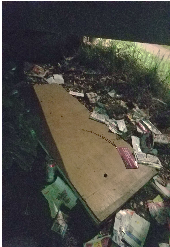
Sorting out the day’s take. Mail from throughout the South Park neighborhood.