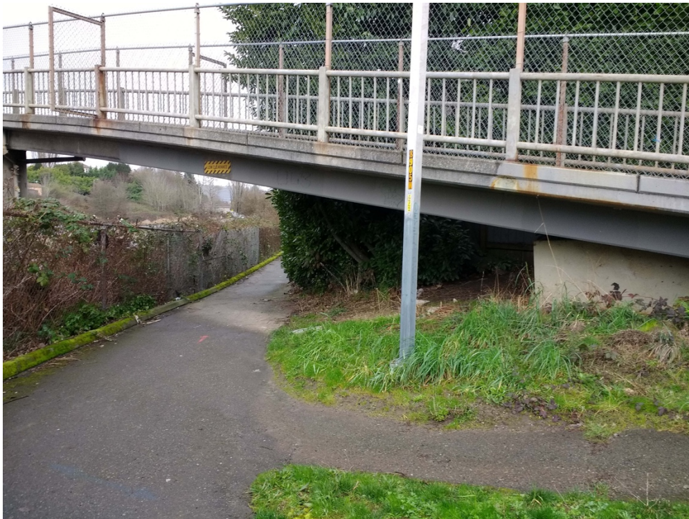
The entrance from the South approaches the main body of the trail with an immediate curve, thick laurel hedge, and the demand that pedestrians walk near a space often used for shelter. On several of our site visits there was evidence of drug and alcohol use here, as well as mail stolen from a variety of addresses in South Park.